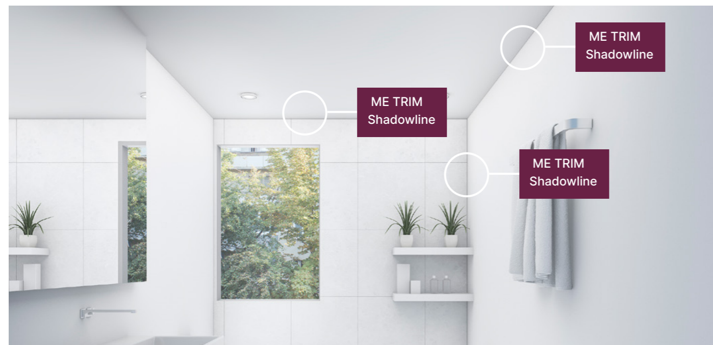
Ceilings and wall shadowline